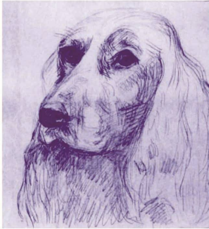
Sketch by the Mother